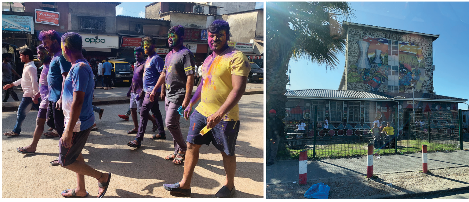
Real photos of Dharavi in Mumbai (left) and Langa in Cape Town (right).

We set up workshop rooms in each location with screens or projectors connected to a laptop, and then we opened DALL-E 2 (a popular text-toimage GenAI tool). To start the discussions, we explained what the system could do and how it was different from searching for images on the Web. Then we prompted DALL-E with, "a London bus in Indian [or African] style in [the place we were holding the workshop]" (Figure 2). In each workshop, the anticipation in the room at this point was palpable. It quickly dissipated, however, as broken-down, rusty, ramshackle