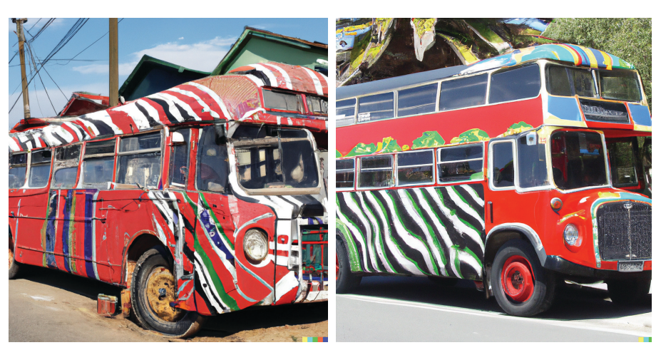
Figure 2. Images generated by DALL-E 2, using prompts created by workshop organizers "A London bus in African style in Langa township" (left) and "A London bus in African style in Camps Bay" (right).

In a way, the AI systems are acting as artificial slum tourists. Large language models (LLMs) are fed by the millions of images taken by visitors, including slum tourists, and by texts describing the social and economic challenges of these locations written by nongovernmental organizations and policymakers, however good their intentions. The LLM we used generated images of these locations that focused and amplified only the negatives; they didn't engage with the fullness of the lives lived there.