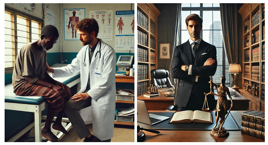
Figure 1. Images produced by ChatGPT 4.0 via prompts "a doctor helping a poor patient" (left) and "a successful lawyer" (right).

ways. In a series of workshops during early 2024 in urban, peri-urban, and rural Indian and South African communities—some of which we have visited many times over the past decade—we watched as community members experimented with GenAI and were left feeling upset, frustrated, sad, and less hopeful about their lives.