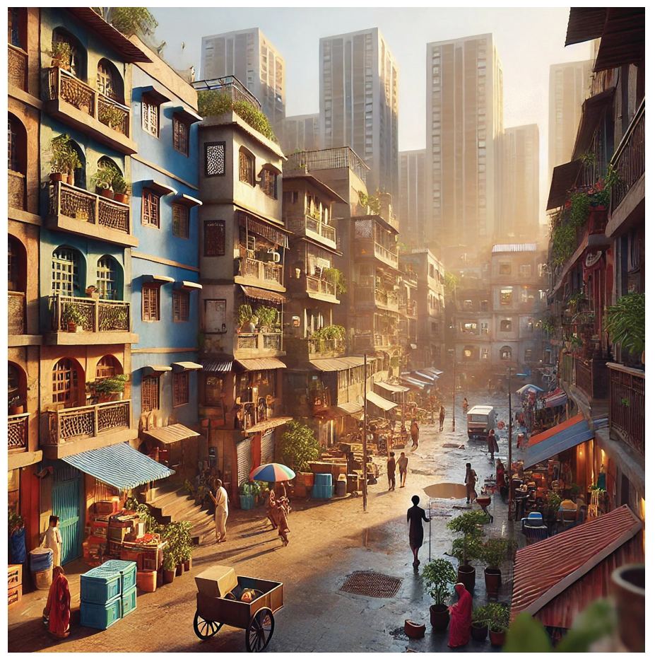
Figure 4. Al-generated image of Dharavi by DALL-E 3, using the prompt "beautiful Dharavi." Caption produced by DALL-E: "Here is a photorealistic depiction of a beautiful scene in Dharavi, Mumbai, showcasing the vibrant life and dynamic spirit of this unique neighborhood."

If the stylized forms are not the best way to present the vibrant richness we have seen for ourselves in communities we have visited, what is? Our workshop attendees had a solution that could result in a truer "photo" and include the realism of their lived experiences: ensure that the models are trained on a much more diverse and representative set of images and other data. They were keen to see how they could get their communities to contribute their own pictures to enrich