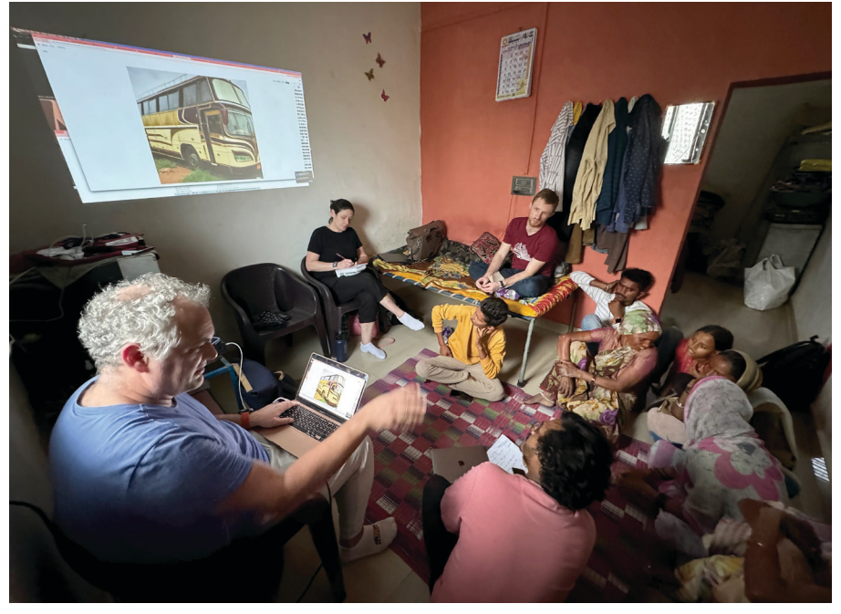
Discussing GenAl images in one of the Banjara community homes.

communicate with the research team and maintain regular contact over an extended period. It is beneficial if the liaison is already familiar with how to formulate research tasks and trials, such that they can help situate design activities and facilitate uptake during workshops and deployments. The liaison should be seen as the first point of contact and a "critical friend" who can provide immediate thoughts or feedback, or tips on how to proceed with data gathering while taking into consideration the values, concerns, and practices of the community.