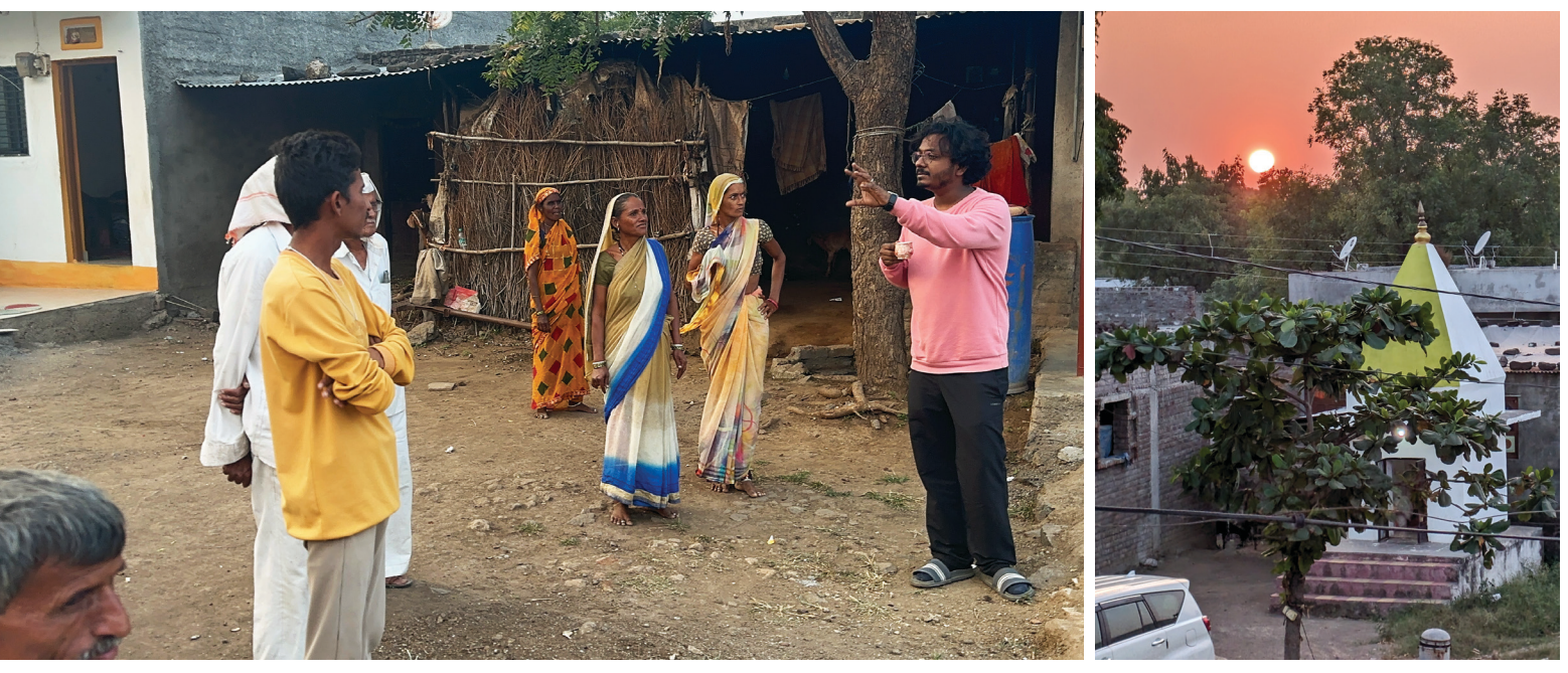
Real photos from the Banjara farming community in India.